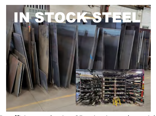
For efficient production, 3E maintains a substantial inventory of sheet and structural steel in various sizes and shapes.