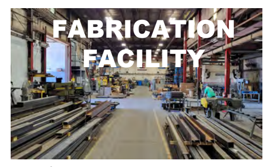
Our custom fabrication capabilities are ready to operate at all times, by providing the flexibility to respond quickly to your operational issues.